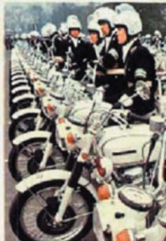
Law enforcement agencies in Japan and many other nations use the Honda CB-750P motorcycle for all types of patrol duties.