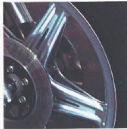
CorStar wheels have earned their reputation. These ones are aluminium alloy.