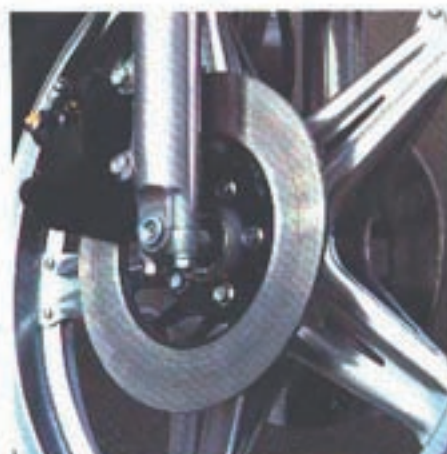
Double front discs (Type D, SA, single disc) provide powerful yet controllable stopping.