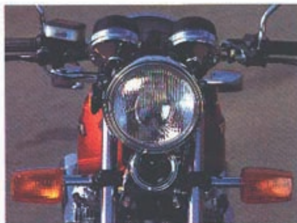
Large 60 watt (Type D, SA: 40-50 watt) head light makes day out of night. Big winners let your intentions be known.