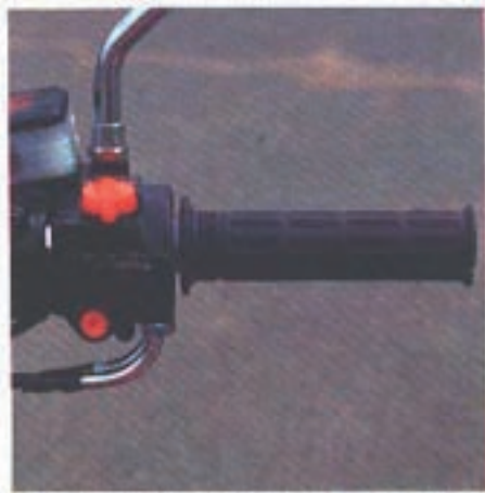
Soft grip and other half of easy-to-use switches completes right end of handbar.