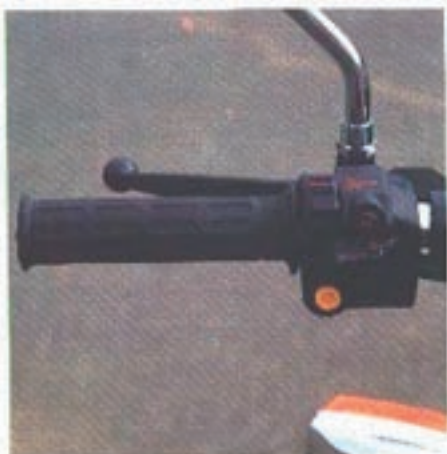
Left hand grip houses one half of the new design, easy-to-use switches. Fatigue-free riding.