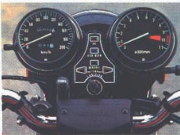
Warning lights, snuggle between large, non-dare easy-to-read tachos and speeds. Necessary information available at a glance.